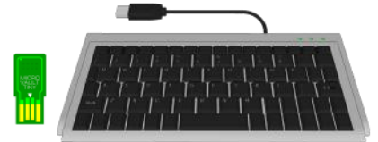
A USB keyboard and 2Gb USB memory key are supplied with the DMO200.