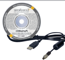
PortaWin-CD und USB-Kabel